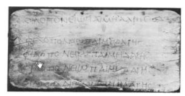
"Work hard, lest you be thrashed" Written four times on a schoolboys' tabula as an object lesson.